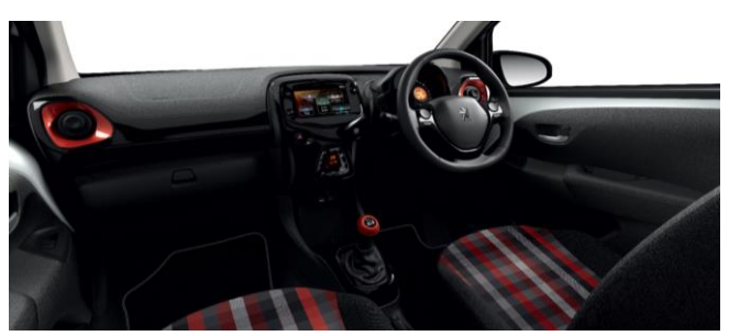
Coral ambience (ENUI) - Standard on Collection -