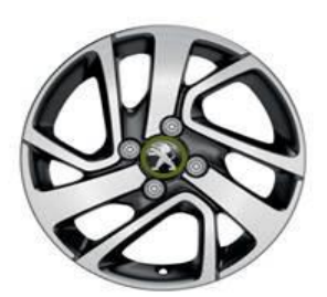
15" 'Thorren' Alloys with Green centre wheel caps