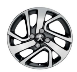
15" 'Thorren' Alloys