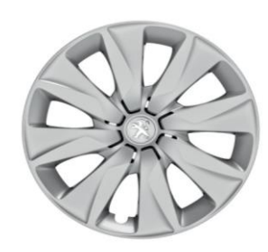
15" 'Brecola' Wheel Trims