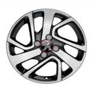
15" 'Thorren' Alloys with Coral centre wheel caps