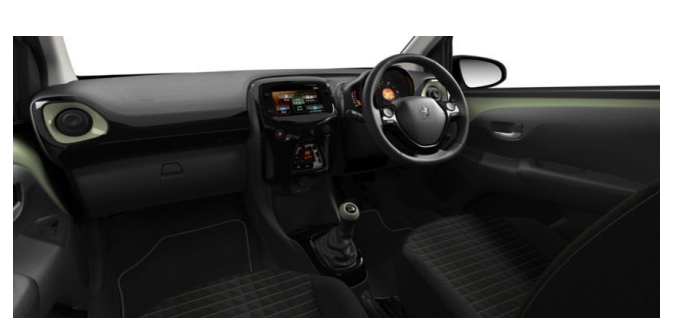
Smooth Green ambience (ENUN) - Standard on Collection - Depending on exterior colours